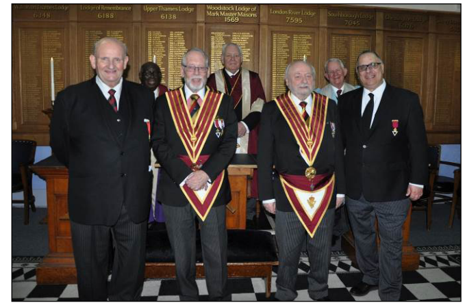
District Grand Council of Surrey web site: http://www.alliedmasonicdegrees.co.uk/