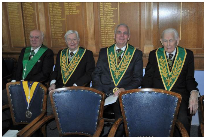
.....Heads of other Orders in Surrey....